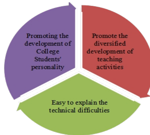
Figure 1. The role of IT in PE.

IT has become a new teaching mode of internalization of knowledge and skills, which plays an important role, as shown in Figure 1.